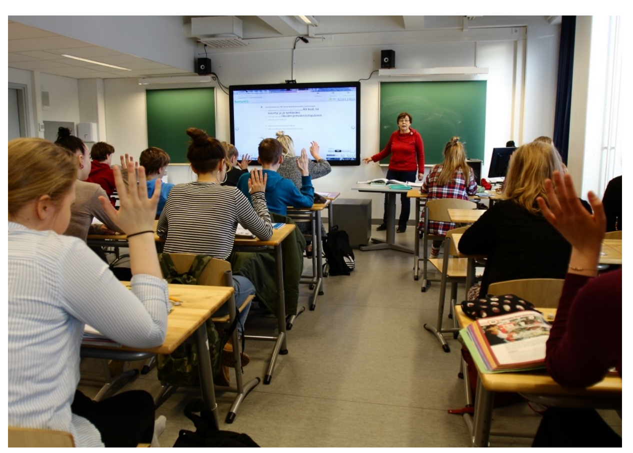
One of our new classrooms with up-to-date teaching appliances.