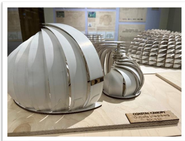
Exhibitions at the Craft and design center