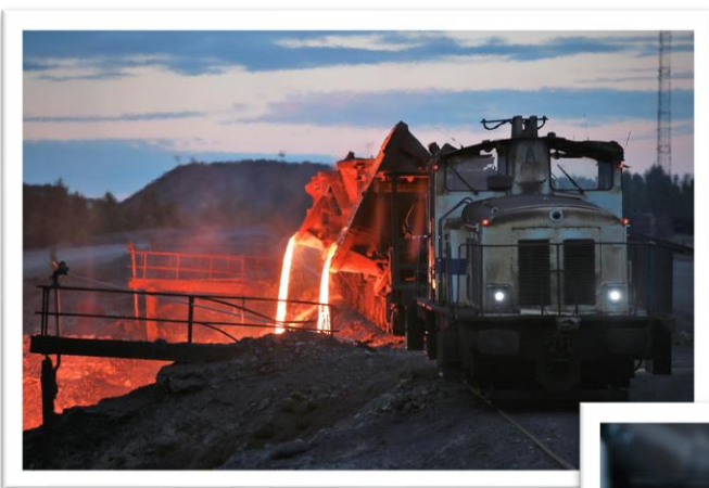
SSAB

SSAB, LKAB and Vattenfall are collaborating to change the Swedish iron and steel industry. Under the name HYBRIT, they are working to develop the first fossil-free steel. The HYBRIT technology has the potential to reduce Sweden's total carbon dioxide emissions by at least ten percent. This is equivalent to one third of the emissions from the industry and may, in the future, help to reduce emissions from iron and steel production globally.