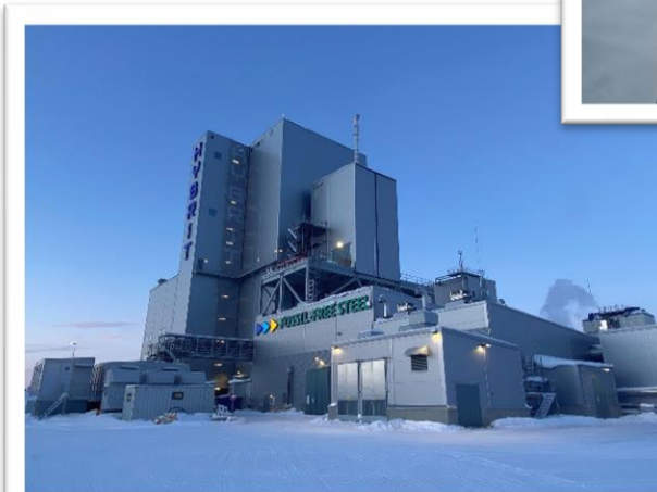
Hybrit plant in Luleå